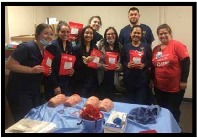
Geisinger Community Medical Center's Stop the Bleed trainings for nursing students and local law enforcement