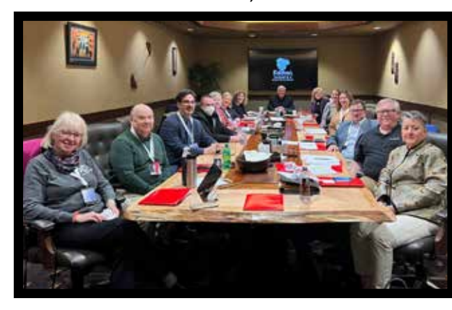
Above: ATSPA Board of Directors meeting in April 2022