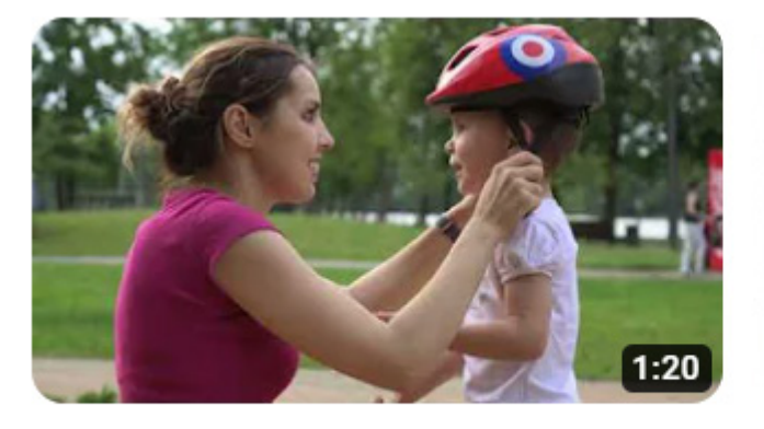
ATSPA Supports In-Patient Trauma Prevention with CHOP