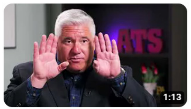
ATSPA's Agricultural Safety Initiatives